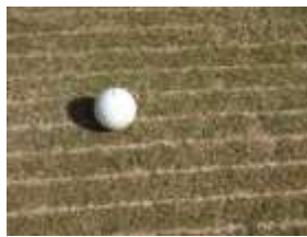
(Plate 1: Aeration using the Graden sand injection)

Often golf greens in the UK are heavily dominated by annual meadow-grass, a weed grass that may not perform well in winter, produces copious seedheads and is very susceptible to disease such as anthracnose and microdochium patch (fusarium patch). It is slow to begin growing in spring, when more desirable grass species are growing, creating a growth differential in the sward. Many golf Course Managers will oversow with desirable grass species, such as red fescue and bentgrass to try to obtain optimal sward compositions for playing golf. However, obtaining a good strike when oversowing can be difficult, with many factors affecting the seed germination and establishment of the seedlings in the existing sward. Recent research at STRI has looked at some of the factors affecting seedling germination and establishment and how the grass surface performs following treatment.