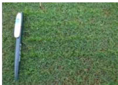
Plate 3: Seedlings following Primo Maxx application 5 days before oversewing with the Graden sand injection with oversewing attachment